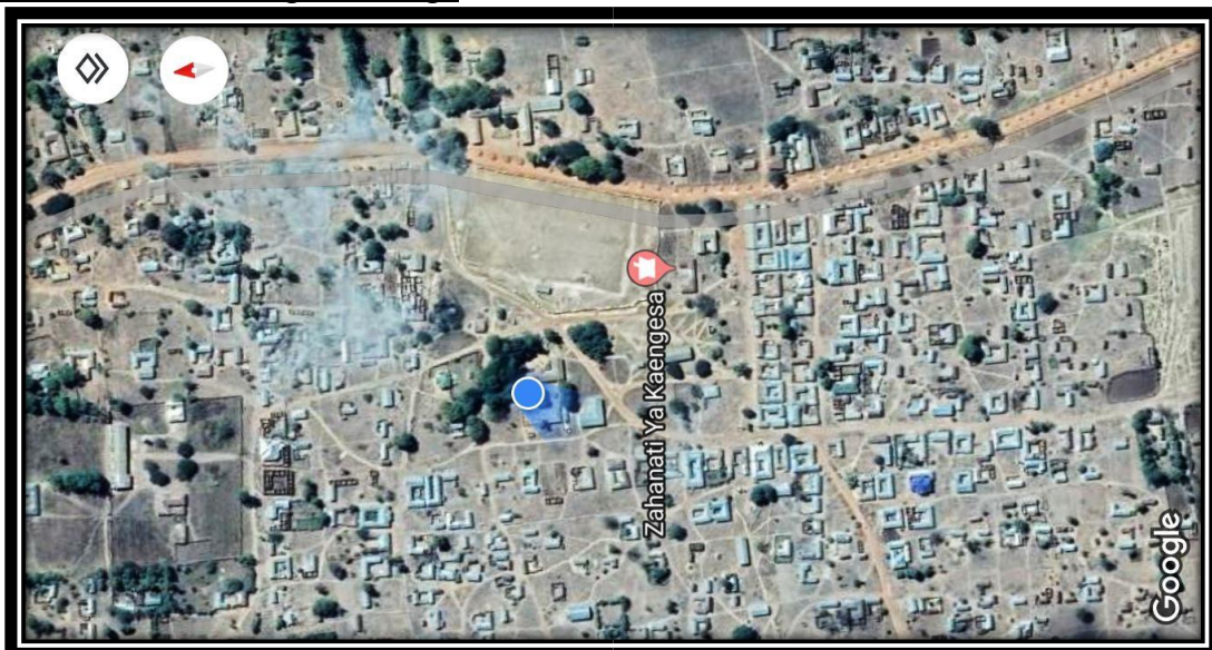
A: Satellite View of Kaengesa Village